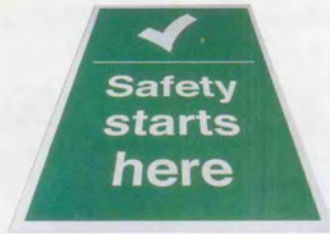
FLO11 400 x 600