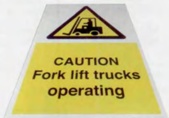
FLO4 400 x 600