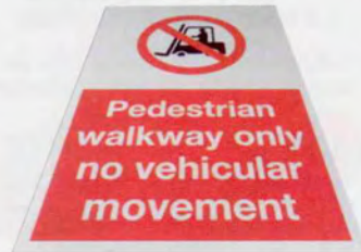
FLO5 400 x 600