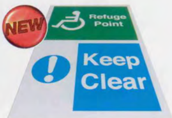
FLO13 400 x 600