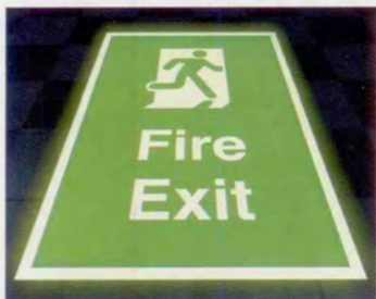
FLO12 400 x 600 Photoluminescent Floor sign