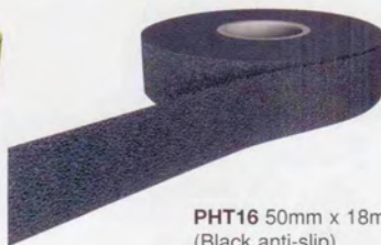
PHT16 50mm x 18m (Black anti-slip)