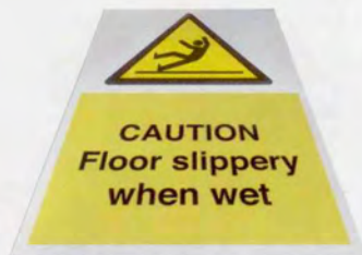
FLO2 400 x 600