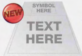
FLO16 400 x 600