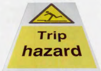
FLO1 400 x 600