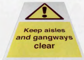
FLO3 400 x 600