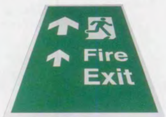
FLO7 400 x 600