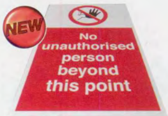
FLO15 400 x 600