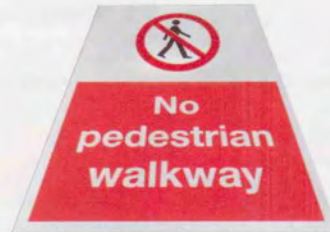
FLO6 400 x 600