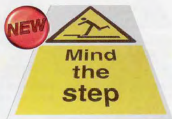
FLO14 400 x 600