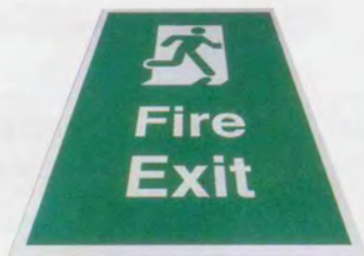
FLO10 400 x 600